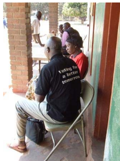
Photo: 'Working for a better tomorrow' – Electoral Commission of Zambia representative attends community meeting

A community meeting was then held to present the memorandum of understanding to the community at large.