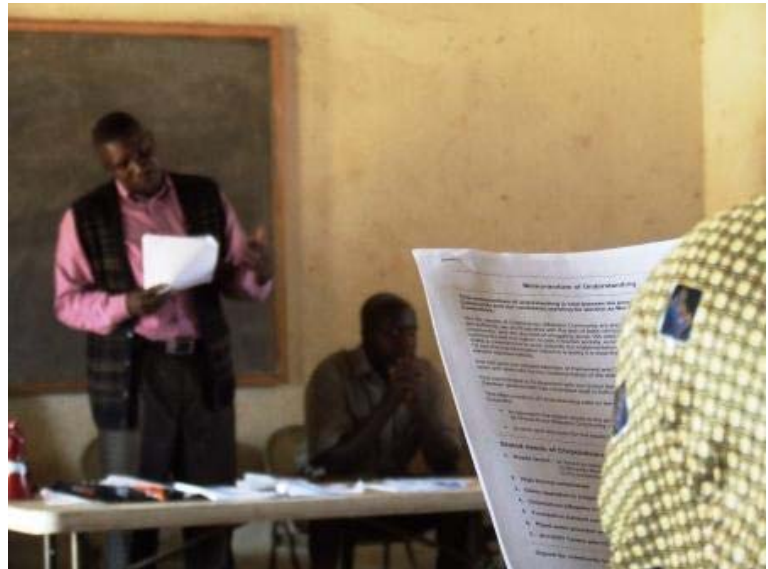
Photo: Church leaders presenting the memorandum of understanding to community members at a community meeting in Mapalo

KEY THEMES: CHURCH COMMUNITY ENGAGEMENT AND ADVOCACY